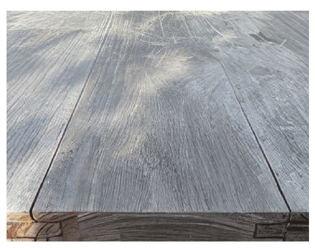
Example of sun-degraded wood.

Teak can sweat out its internal oil. This will always happen due to a sudden absorption of a sudden absorption of a large amount of water (heavy rain).